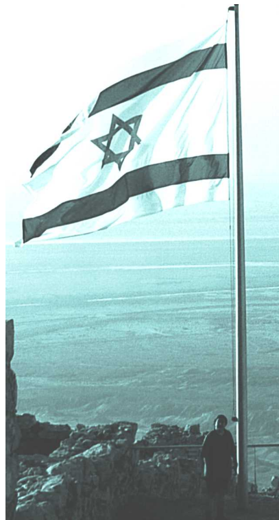
Israeli flag atop Matsada, overlooking the Dead Sea. Photo by E. Yechiel, 2002.